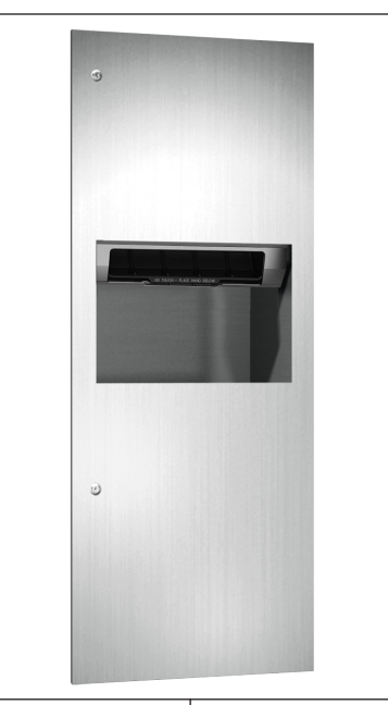
Scan for Information