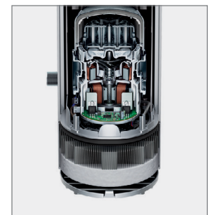
AB09/10/11 and WD04/05/06 HEPA Filter: SKU# 965395-01