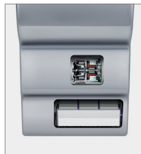
AB02/04/06/14 HEPA Filter: SKU# 925985-02