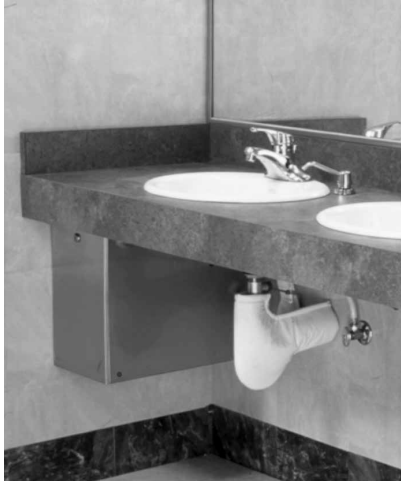
B-830 Cabinet for 12-liter Soap Tank Cartridge