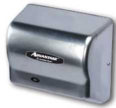
Steel Satin Chrome