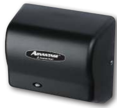
Steel Black Graphite