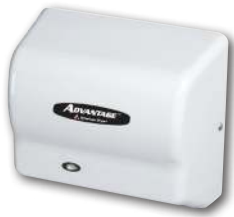
Steel White Epoxy