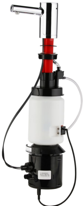
Product protected under: Pat. www.bobrick.com/patents/